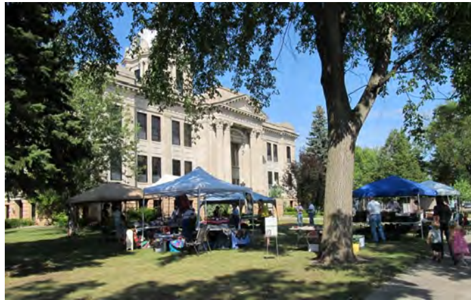
Twin Towns Gardeners' Market at the Richland County Courthouse on August 30