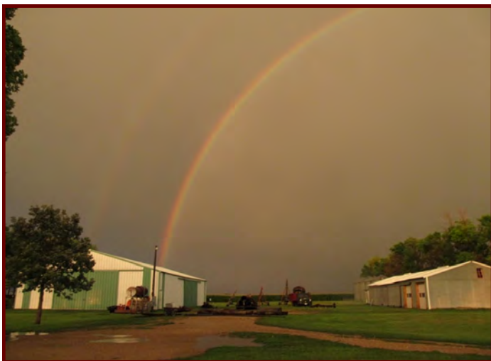
Our farm under the double rainbow — God's promise twice, never to flood the earth again!